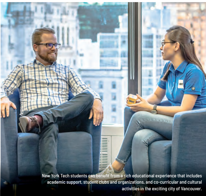
New York Tech students can benefit from a rich educational experience that includes academic support, student clubs and organizations, and co-curricular and cultural activities in the exciting city of Vancouver.